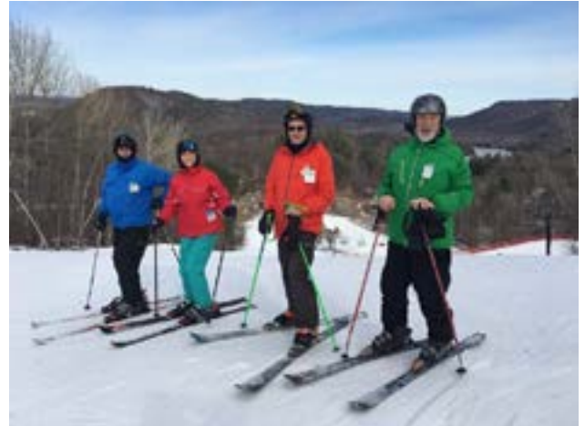
Feb. 2018 - Meet'n'Ski at Mont Ste-Marie

The 2022 Winter Olympics are less than 5 months away, and RA Ski members will be on the slopes well before that with a full program of Meet n'Ski day trips, special theme ski days and a bus trip or two that will, hopefully, round out our first full program in a long time !!