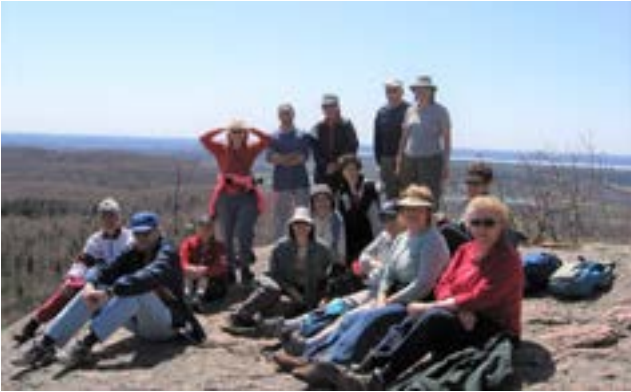
April 2006 – King Mountain view