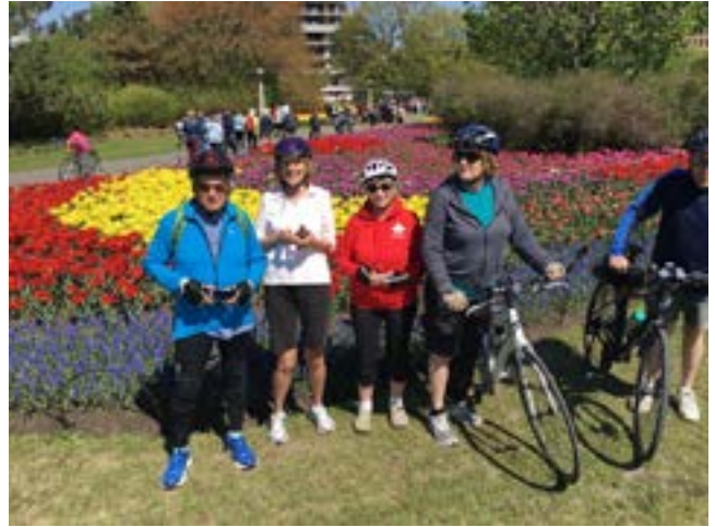
May 2018 – Cycling, Dow's Lake tulips

Thanks to our RA Ski photographers for providing us with some great pictures of our weeklong, weekend and day trips.