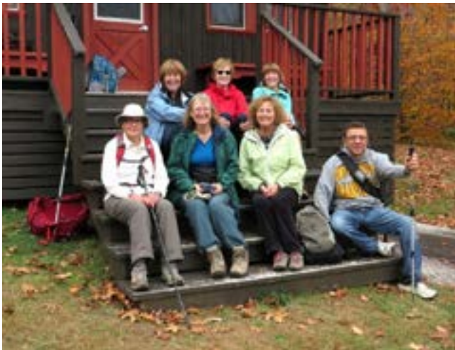
Oct. 2014 – Lusk cabin

Meet at Parent Beach at 10AM for a hike along then lake, then up to Lusk Cabin. (approx distance 12-14 km) Bring a lunch and water. Trip leader - Cathy McGregor