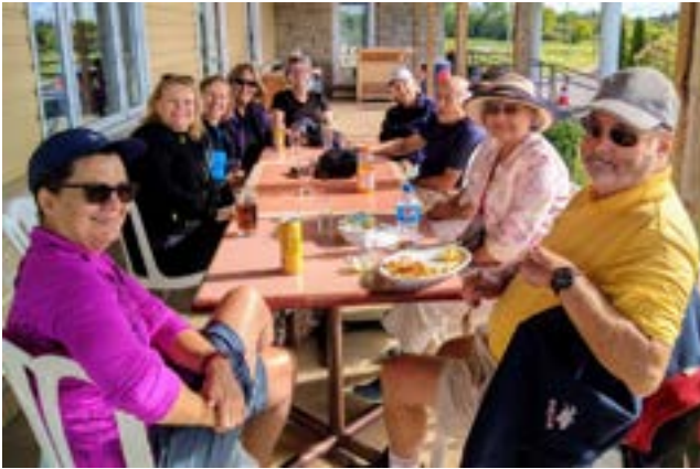
SepSept. 2021 – 19 th hole at Anderson links