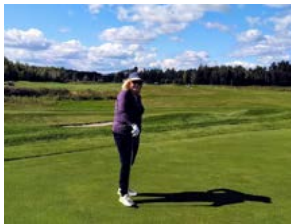
Sept. 2021 – Golfing at Anderson Links

We had a best ball golf day on Friday, September 10th at Anderson Links Golf Course. We had one in August that was enjoyed by 8 avid golfers, despite warnings of thunderstorms, stifling heat and other dire possibilities. We defied the odds, enjoyed ourselves under cloudy skies but no rain and the sun didn't come out until we were sitting in the shade on the patio enjoying refreshments post-game.