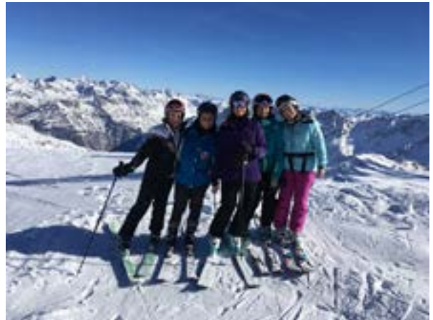
Jan. 2019 – Weeklong at Sölden, Austria

Visit us on Facebook to learn about upcoming events, read members' comments, and much more! Go to RA Ski and Snowboard Club of Ottawa and ask to join in.