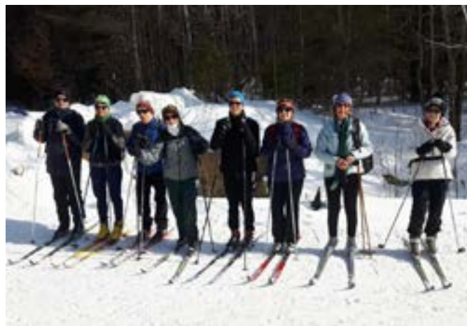
Feb. 2020 – XC ski to Taylor Lake yurt

We are in need of leaders particularly for the outings on the Ottawa side of the river. Let us know if you can help.