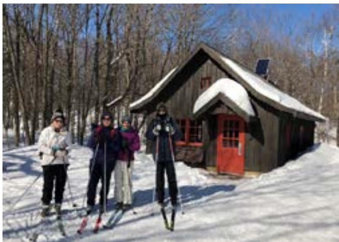
Feb. 2020 – XC skiers at Huron cabin

Our outings are on our website, www.raski.ca