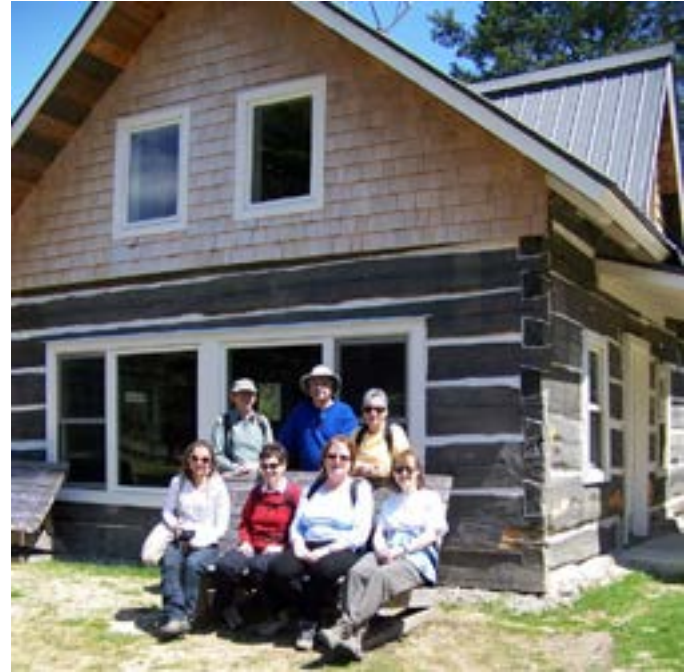
May 2009 – Hikers at Herridge cabin

Meet at P16 (Pine Road) to leave at 10:30 AM for a hike to Herridge. Bring a lunch. 10 km round trip. Email xc-2020@raski.ca by 7 PM on Oct 4 if you plan to attend.