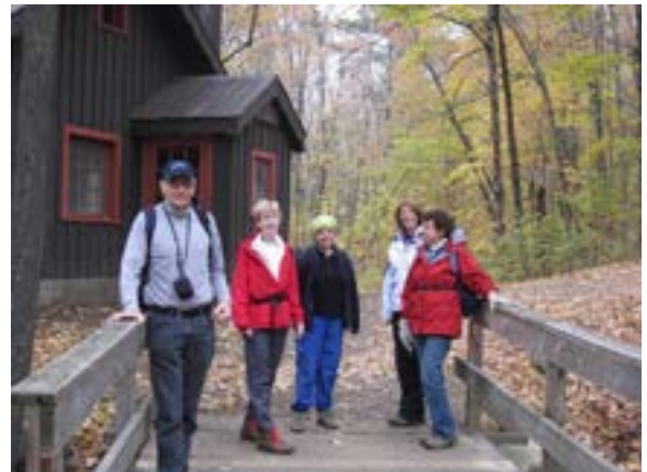
Oct. 2009 – Keogan cabin

Note change in location to a bigger parking lot during leaf season. Meet at 10:30 AM at P7 to hike to Keogan Cabin and back. Approx distance 8.5 km round trip. Trip Leader - Louise Cameron